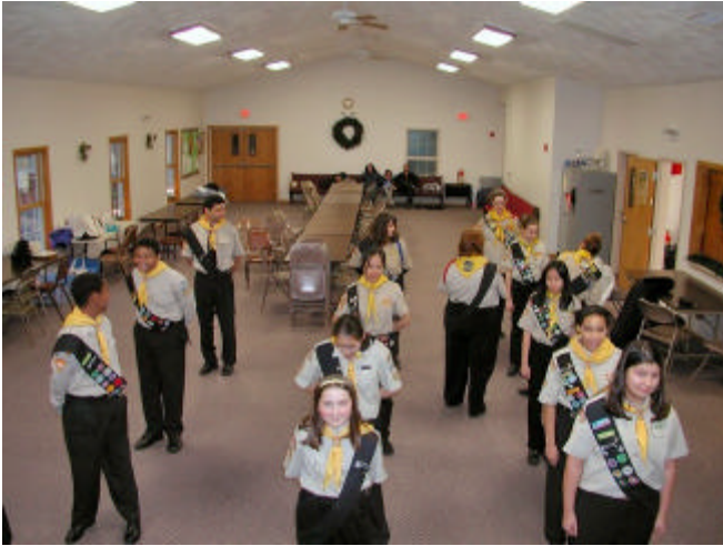
Pictured from left: Archers, Chick-lets, and Golden Girls units