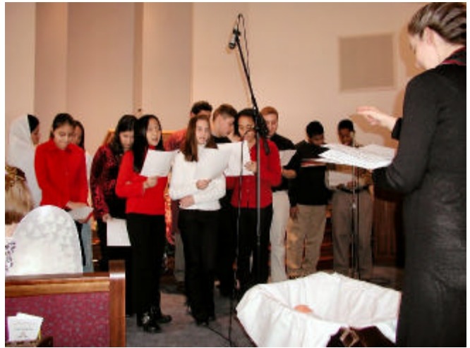
CHRISTMAS PROGRAM - KIDS CHORUS