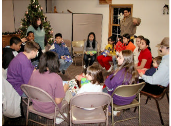
Pictured: King's Kids Pathfinder Club