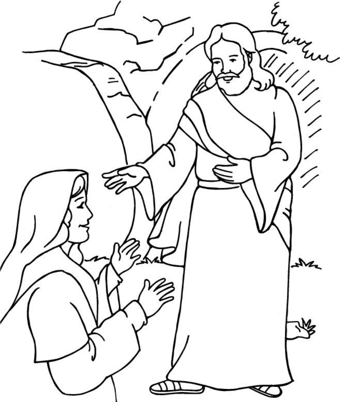
Jesus Is Alive Matthew 27, 28, John 18-20

Kids - get your crayons and color this picture