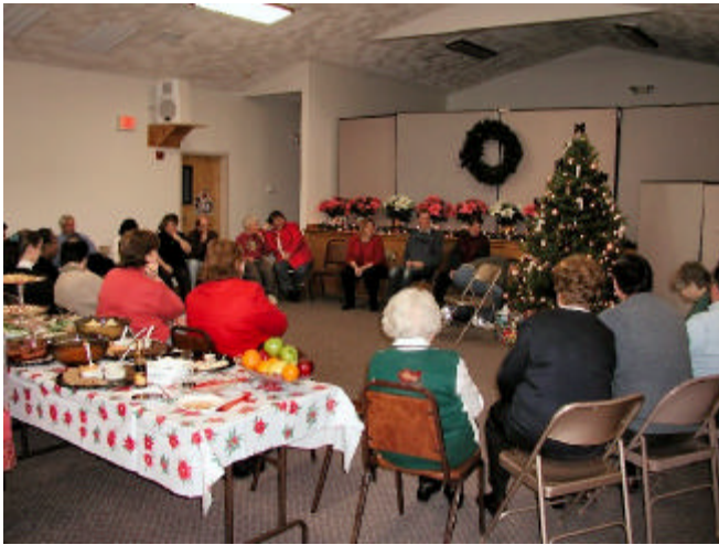
ADULT CHRISTMAS PARTY