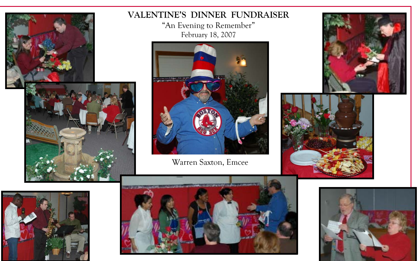
The Valentine's Dinner fundraiser made $435.00 for the Church Building Fund. Praise God for a wonderful evening of fellowship, food and fun.