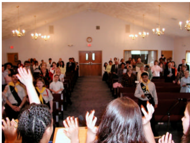
Pictured: Merrimack Valley congregation singing "Lord I Lift Your Name on High"