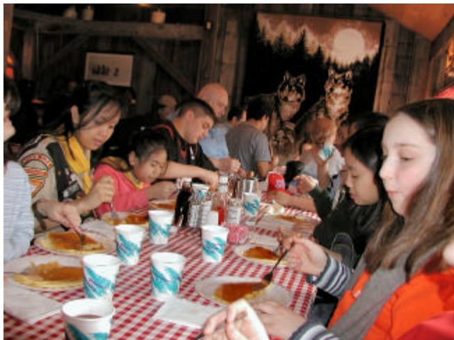
Pictured: King's Kids having pancakes with maple sugar syrup at Parker's Maple Barn

Pathfinder Sabbath on March 27 was a wonderful experience. The Pathfinders participated in everything from Sabbath School through the church service. We then enjoyed a potluck lunch. During the afternoon we had a group of 40 people join us at the New England Aquarium.