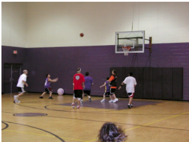
Pictured: Merrimack Valley All-Star Game