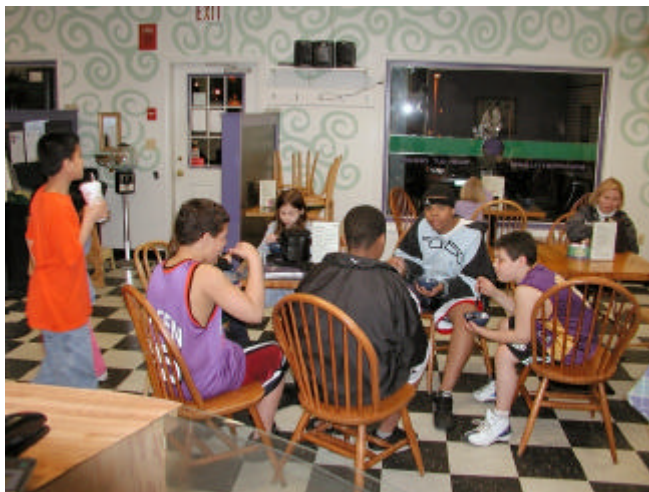
Pictured: the guy's table