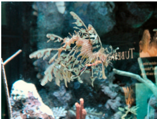
Pictured: New England Aquarium "Sea Dragons" from Australia

Pathfinder Sabbath on March 27 was a wonderful experience. The Pathfinders participated in everything from Sabbath School through the church service. We then enjoyed a potluck lunch. During the afternoon we had a group of 40 people join us at the New England Aquarium.