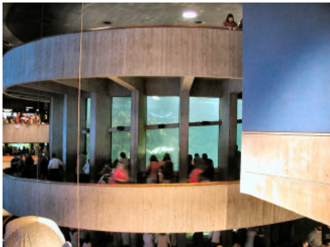
Pictured: Center reef tank at the New England Aquarium