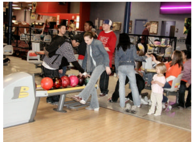
Pictured: King's Kids at the bowling alley.

The past two months have been exciting and busy for the Pathfinders. In February we went bowling at the Brunswick Lanes in Lowell. Rita's extra light bowling ball was very popular with the group. Only a couple of us fell on our faces (literally) while bowling.