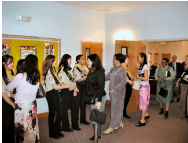
Pictured: King's Kids Pathfinder Club and Merrimack Valley congregation