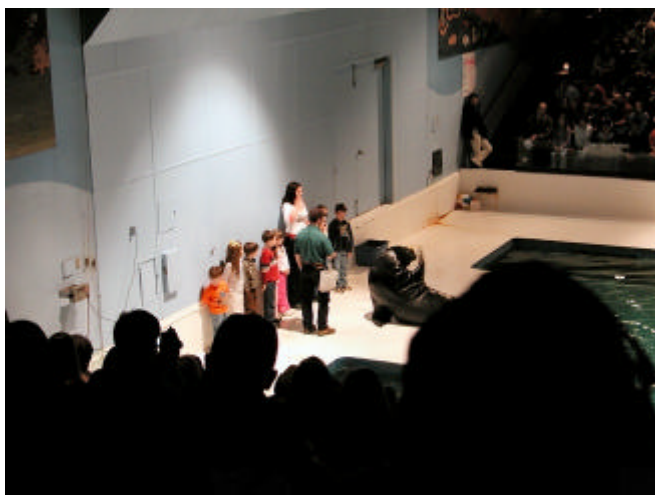
Pictured: Tyler the sea lion and his friends