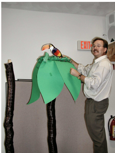
HELPING WITH VBS DECORATING