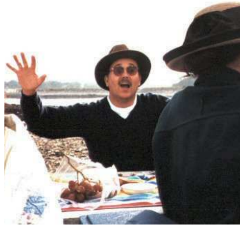
JOINING US FOR VESPERS ON THE OCEAN