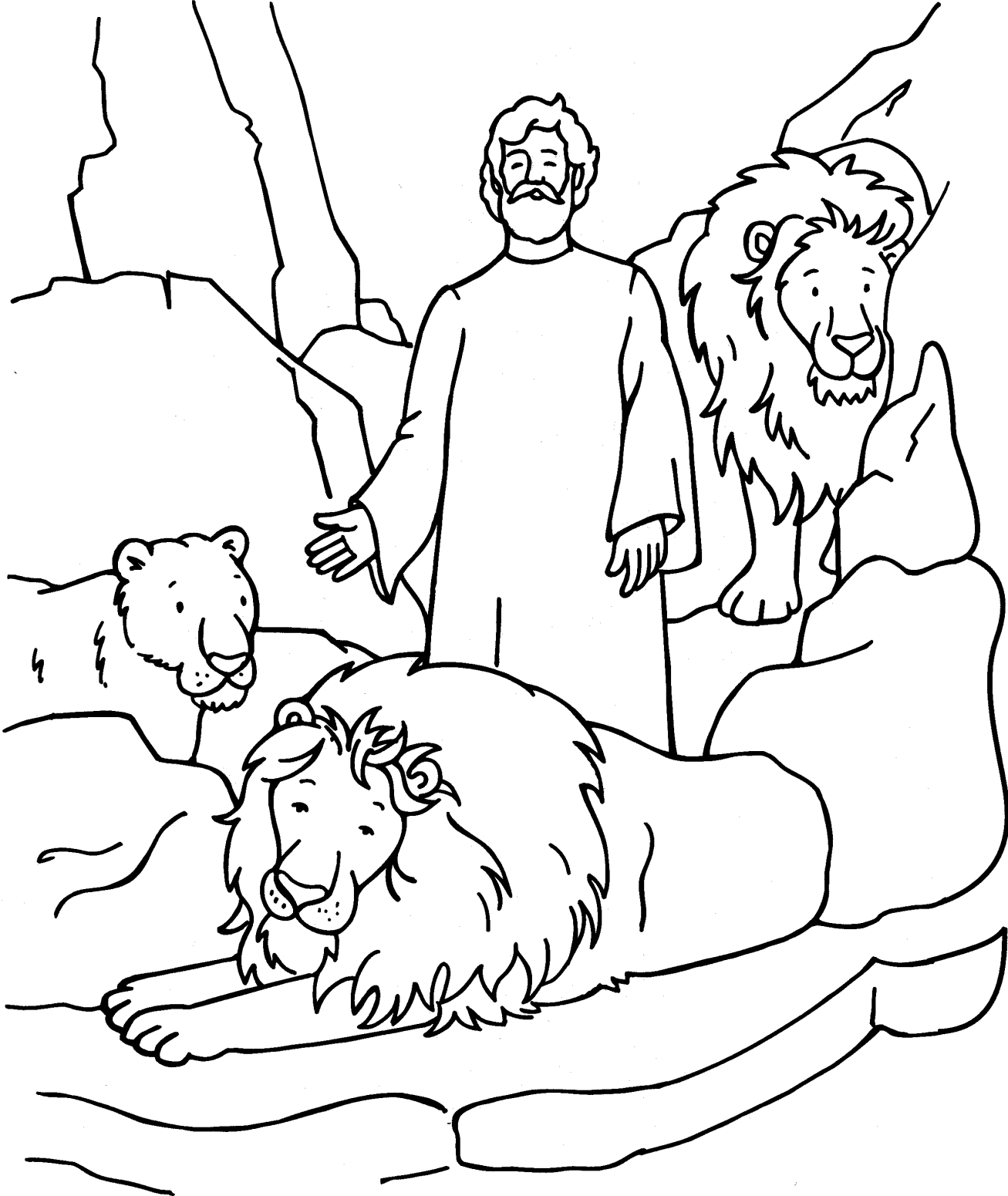
Daniel Prays to God Daniel 6

Kids - get your crayons and color this picture