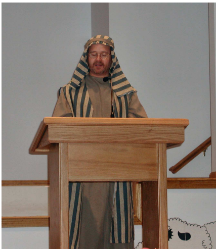
SHARING THE GOSPEL IN CHARACTER