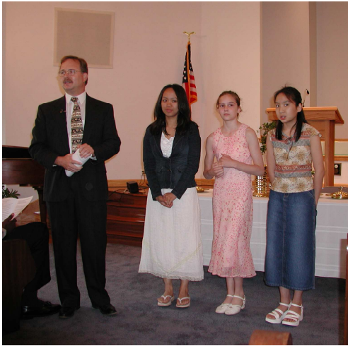
WELCOMING NEW MEMBERS