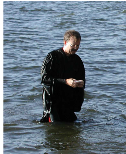
GIVING NEW LIFE THROUGH BAPTISM