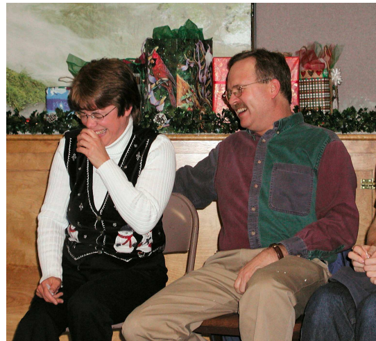
BEING THERE FOR CHRISTMAS PARTIES