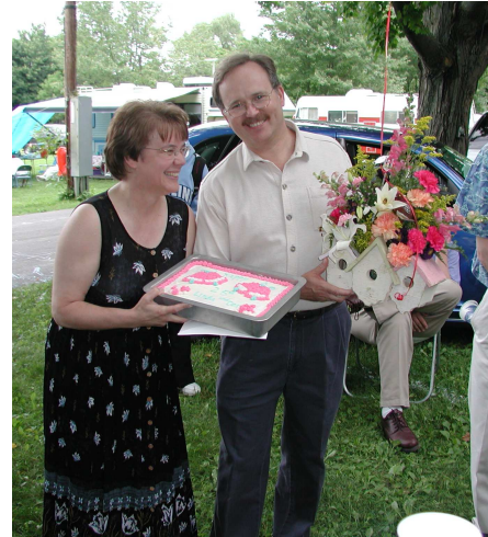
YOUR COMMITMENT TO EACH OTHER