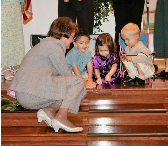
HELPING WITH BEGINNERS