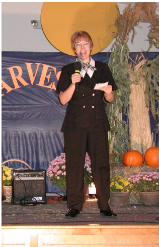
SINGING FOR TALENT NIGHT