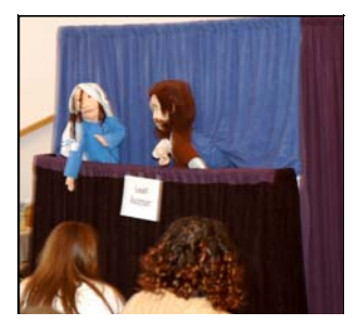
Children's Corner: D.O.G. Puppet Ministry