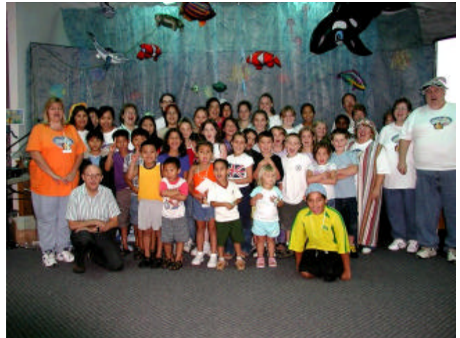
Pictured: the whole S.C.U.B.A. crew & staff 2003

The week closed with family participation on Friday and a presentation of certificates for completing the program. Everyone was sad to see the week end and as the children were leaving you could hear "I'll definitely be back next year." "I wish this didn't have to end." "What will next year be like?" "Thank you... ."