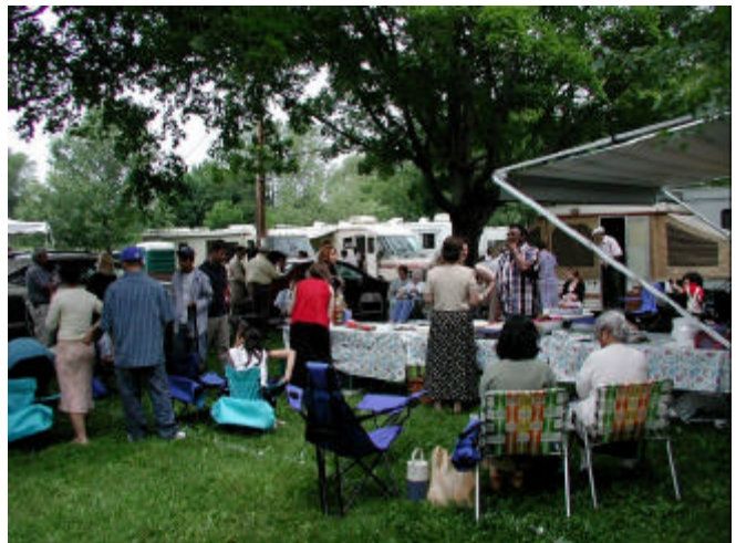
Pictured: Merrimack Valley family and friends