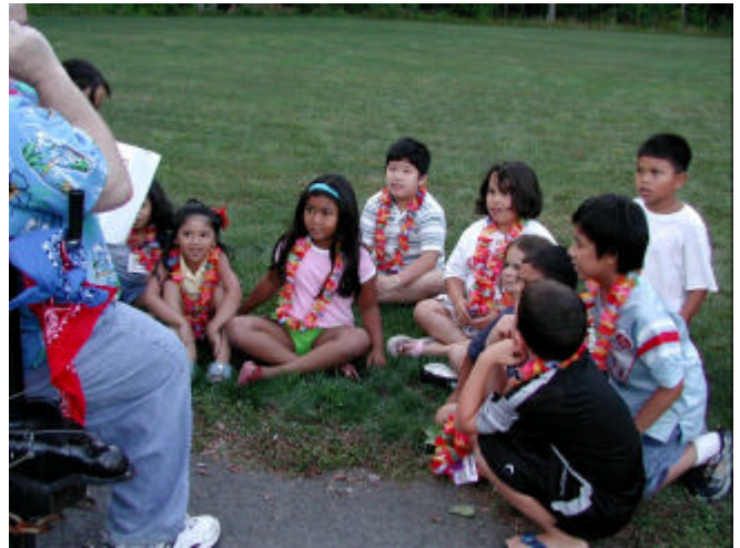
JUNGLE GYM GAMES