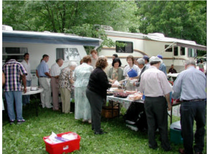
Pictured: Merrimack Valley family and friends