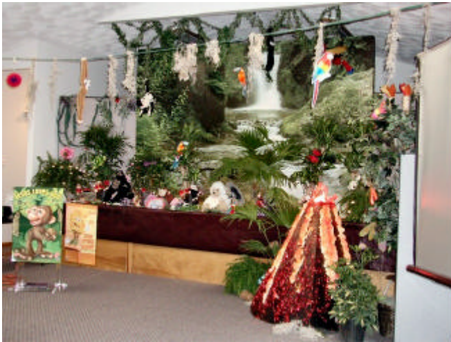
LAVA LAVA ISLAND