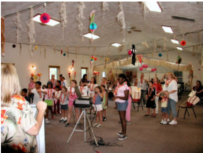
SING AND PLAY BAY